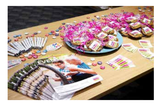
Launch event for the new Oshawa Public Libraries logo

"Oshawa Public Libraries gets a bright new visual identity, featuring bold and spring-like purple, pink and green tones." -Ad/Lib Library Marketing, Advertising & Branding