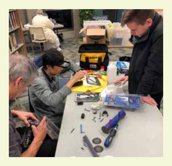
From vacuums to computers, our Repair Café volunteers can fix it all

"I can't believe they fixed my laptop after 2 years! I was going to throw it out. Thank you!" -Repair Café participant