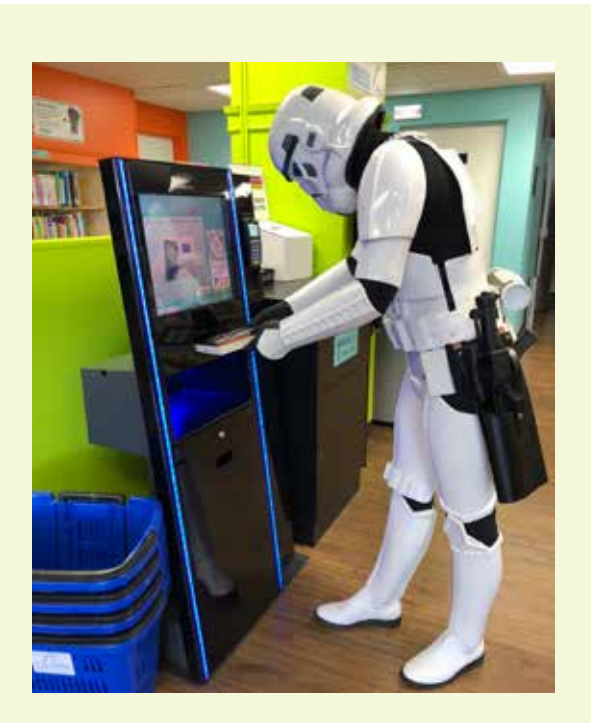
Storm Trooper checking out books at our third annual OPL FanCon

"I can't believe they fixed my laptop after 2 years! I was going to throw it out. Thank you!" -Repair Café participant