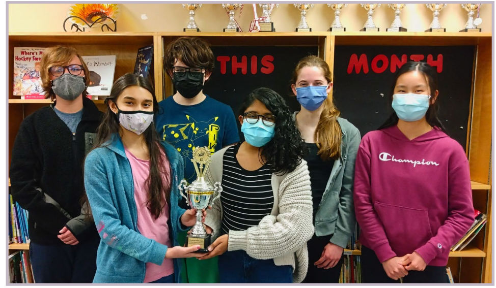
2022 Champions, Coronation Public School (Oshawa)