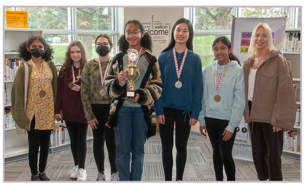
2023 Oshawa Intermediate Finalists, Coronation Public School