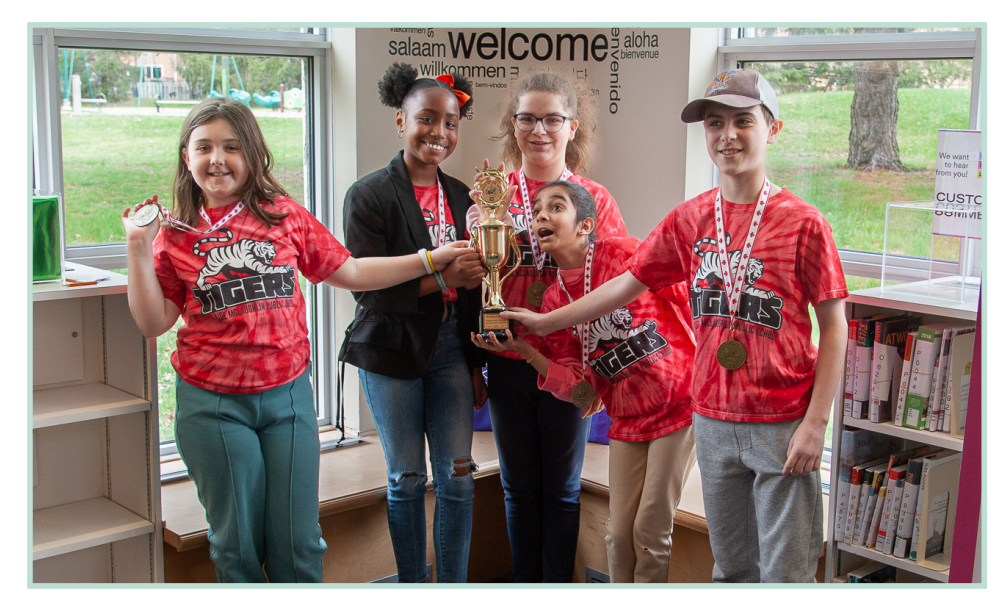
2023 Oshawa Junior Finalists, Adelaide McLaughlin Public School

905-579-6111 ext. 5256 | ayntema@oshawalibrary.on.ca