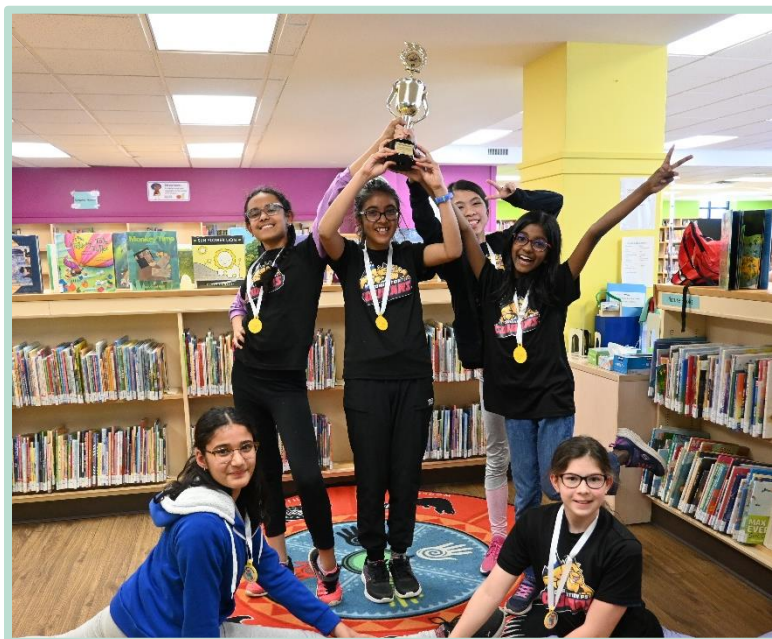
2024 Regional Junior Champions, Coronation Public School (Oshawa)