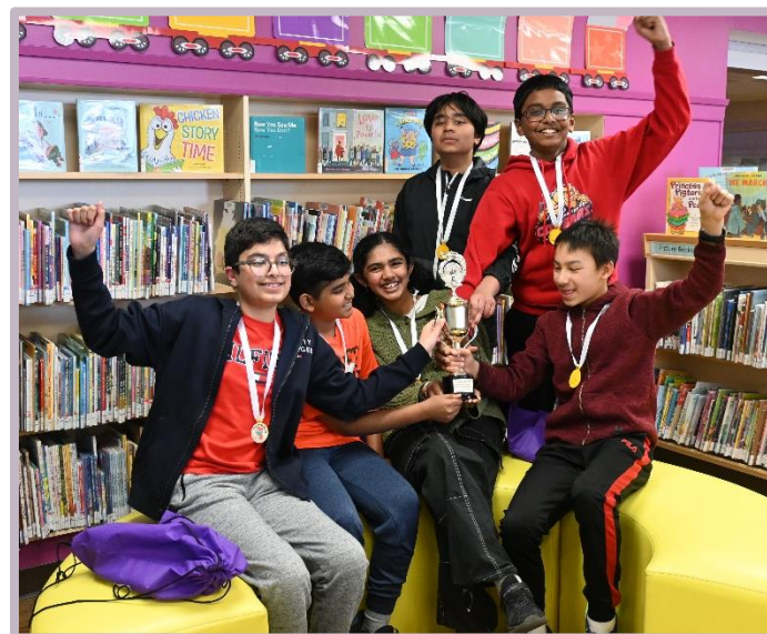
2024 Oshawa Intermediate Finalists, Coronation Public School