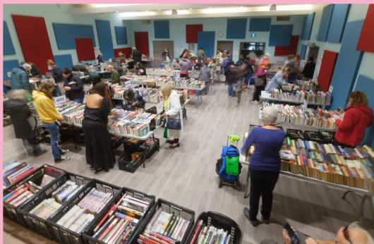
Book Sale at the McLaughlin Branch