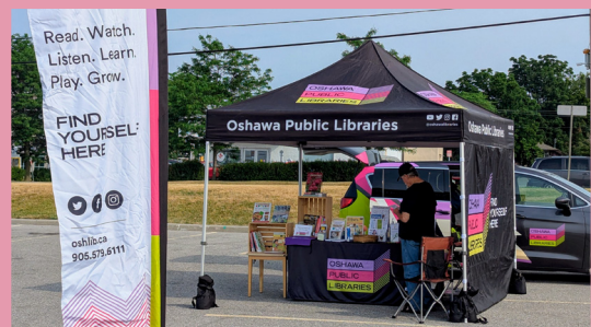
At the Farmer's Market, Oshawa Centre