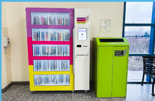
Library Lending Machine at the Civic Rec Centre