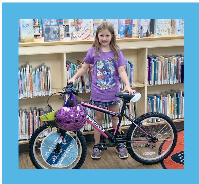
Winner of the TDSRC Grand Prize bike!

Thank you to our generous sponsors for supporting special Library initiatives throughout 2025.