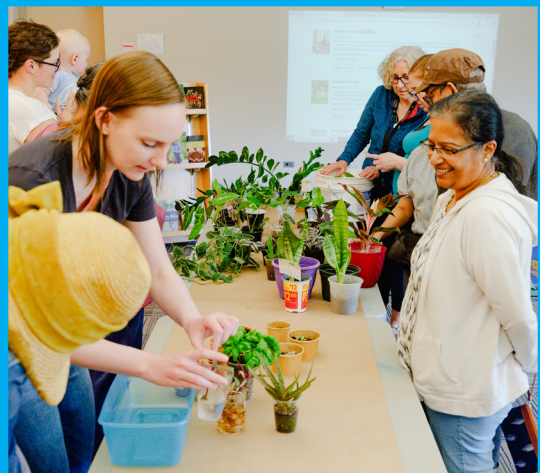
Library Plant Exchange program at the John Aker Northview Branch