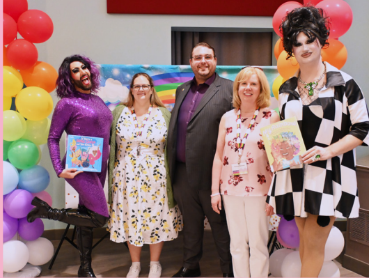
Drag Queen Storytime