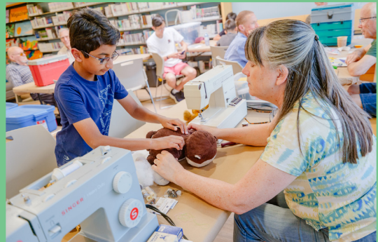
Toy Repair Café at the Delpark Branch