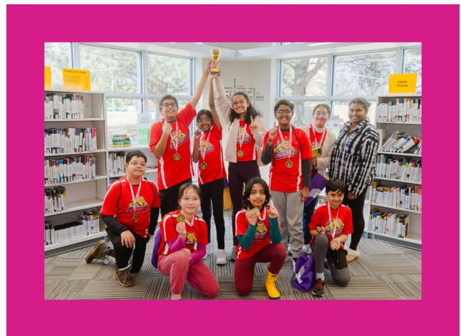
Coronation Public School at Battle of the Books

participants joined the fun at our special March Break programs.