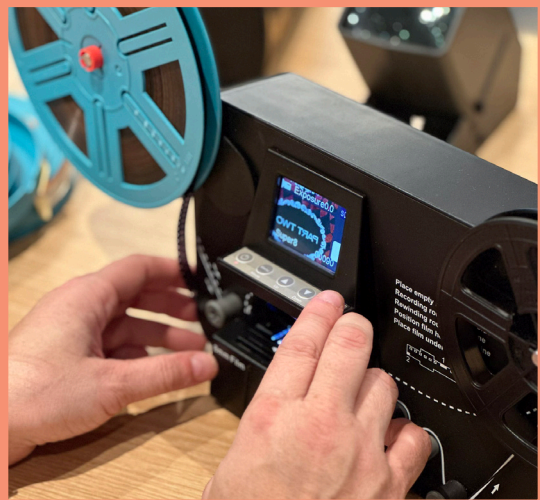
Memory Lab at the McLaughlin Branch