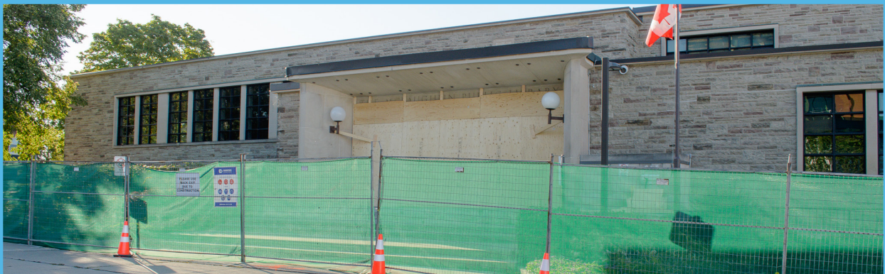
Front steps and ramp replacement project at the McLaughlin Branch