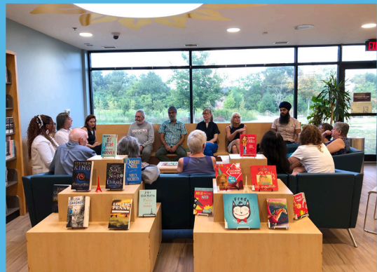
French Conversation Circle at the Delpark Branch